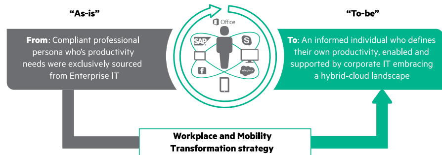
Figure 1: HPE Workplace and Mobility Transformation